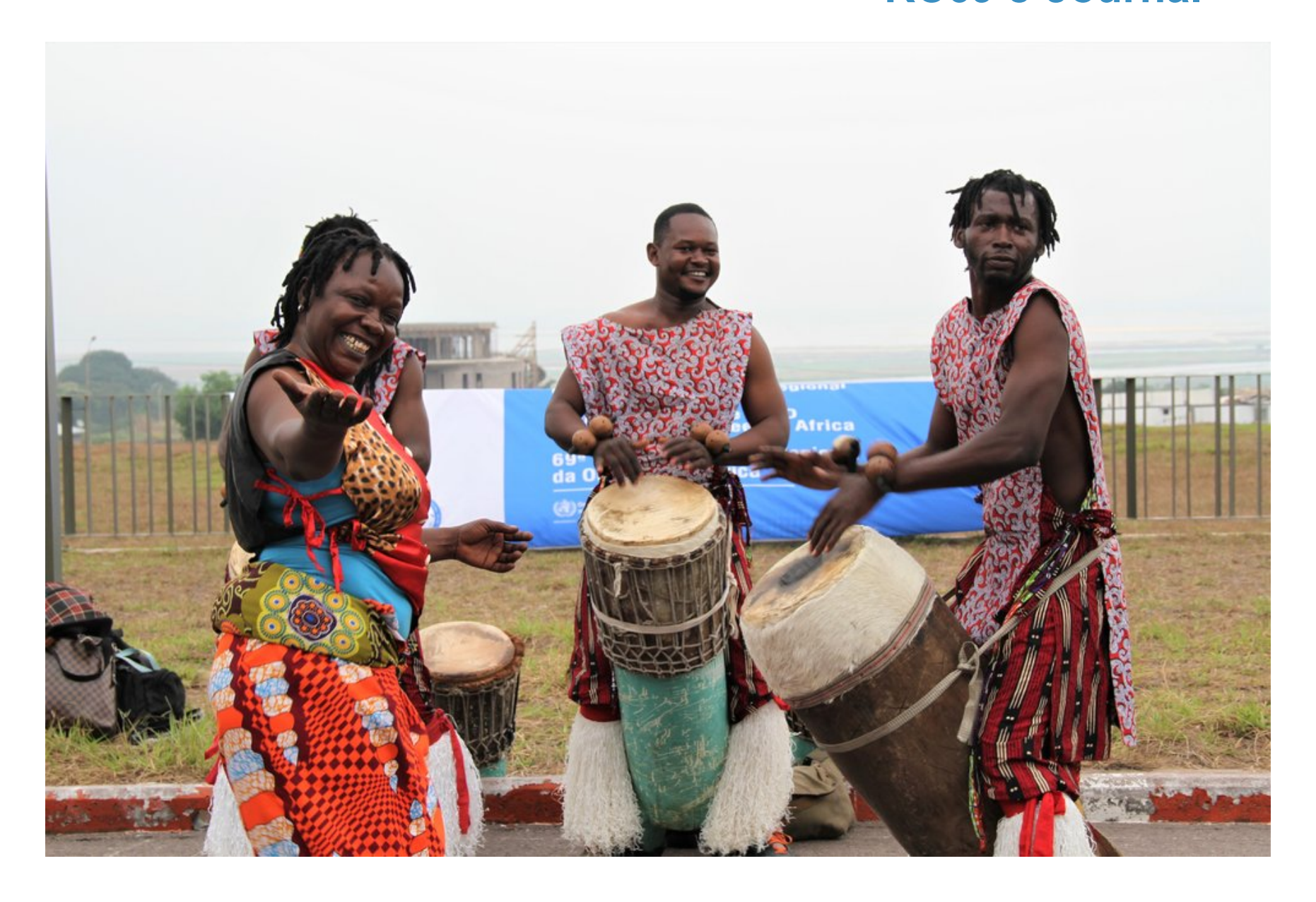
RC69 opens with a clarion call for health for all