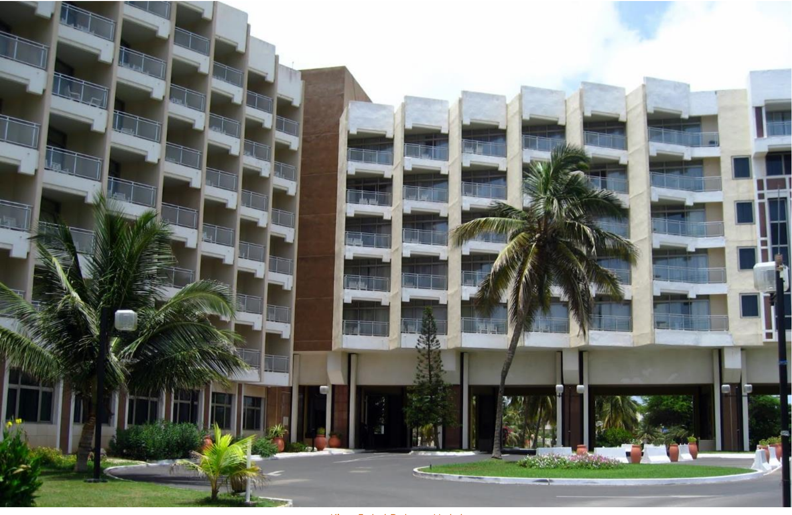
King Fahd Palace Hotel