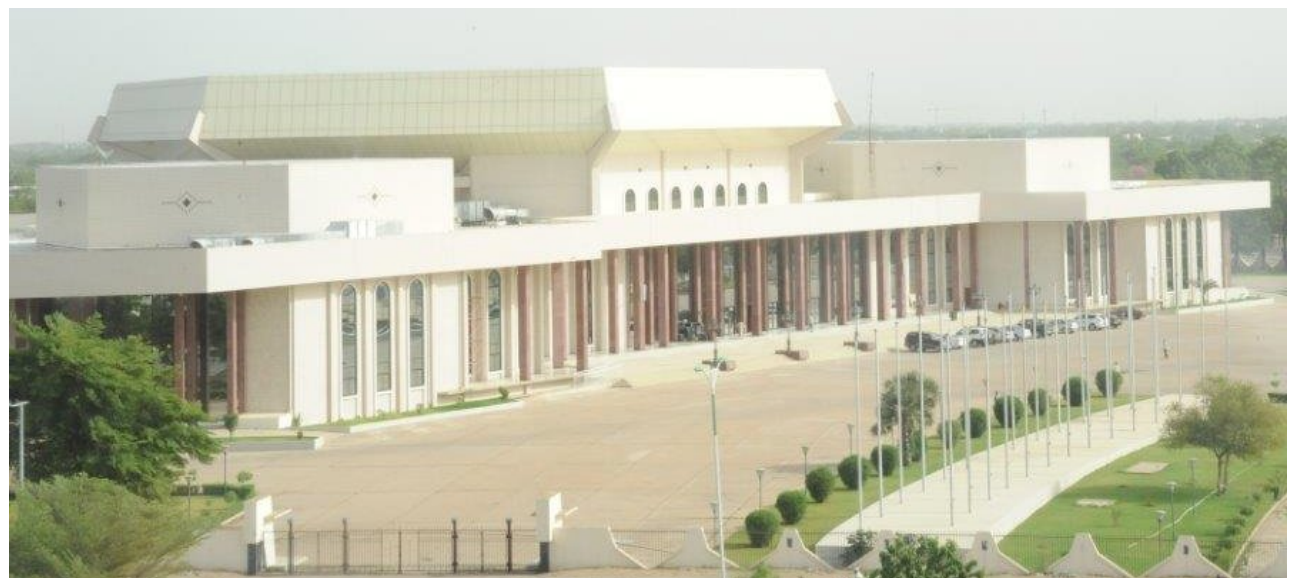
Front view of the Palais du 15 Janvier