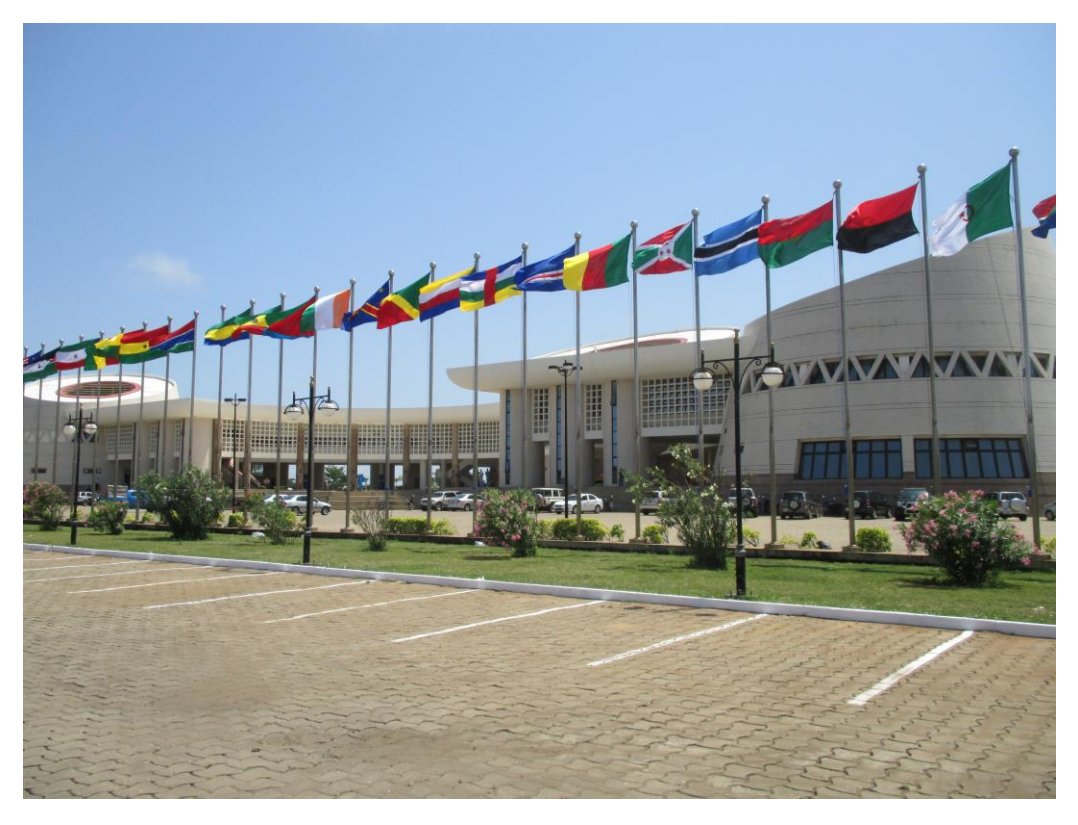
Front view of the Palais des Congrès, Cotonou