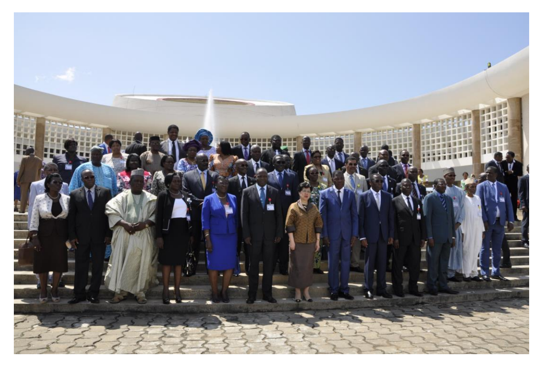
Group photograph taken shortly after the opening ceremony