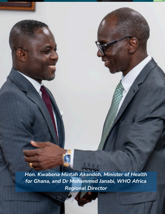
Hon. Kwabena Mintah Akandoh, Minister of Health for Ghana, and Dr Mohammed Janabi, WHO Africa Regional Director