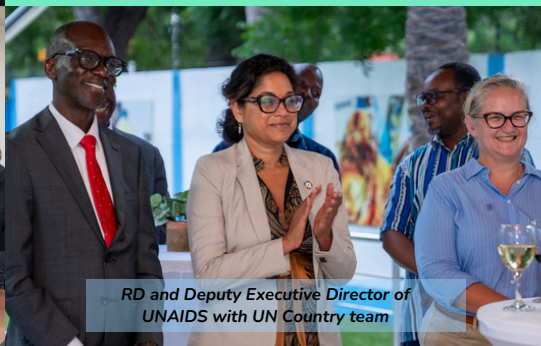
RD and Deputy Executive Director of UNAIDS with UN Country team