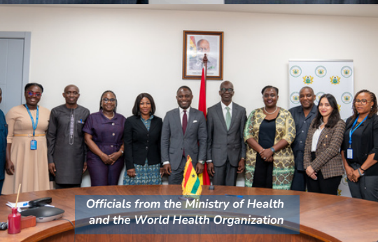
Officials from the Ministry of Health and the World Health Organization