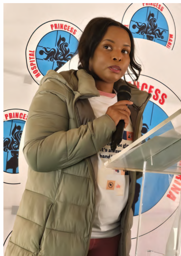
A participant shares her knowledge on proper hand hygiene practices

The walk, which drew hospital staff and community members alike, set the tone for a day focused on proactive and preventive health measures. Read More