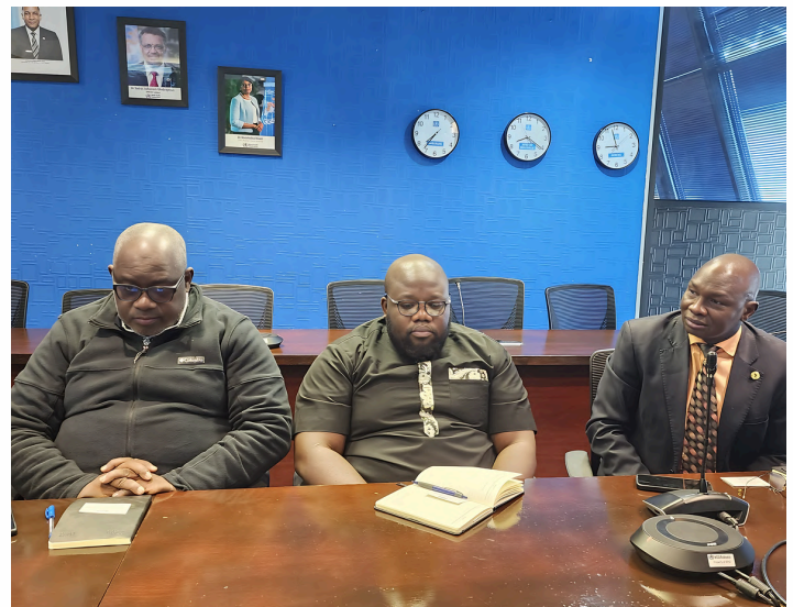
Africa CDC staff accompanying their Regional Director