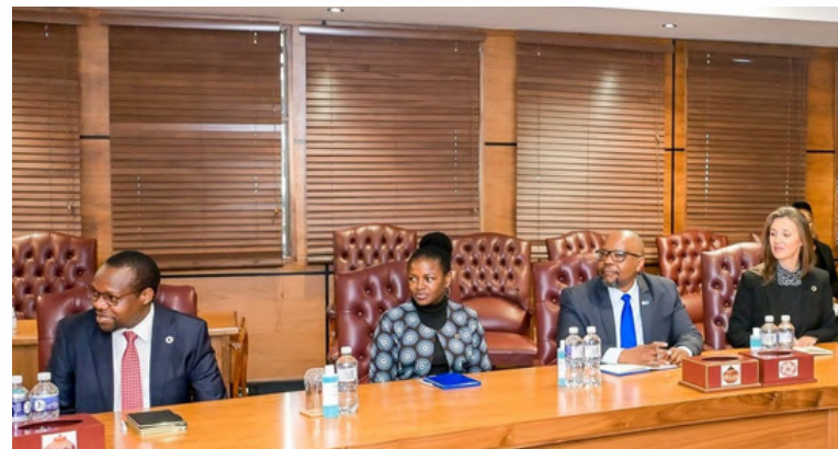
WHO Regional Director Emeritus joined by WHO Botswana delegation