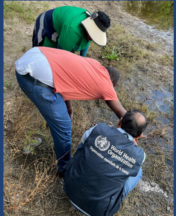
WHO experts conducting an assessment in malaria-endemic areas