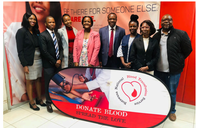
WHO delegation with NBTS officials at the lab