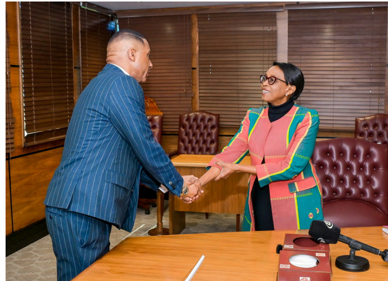
President Advocate, Duma Boko and WHO Regional Director Emeritus Dr. Matshidiso Moeti

President Boko spoke candidly about the reality that Botswana's health sector is facing. Read More