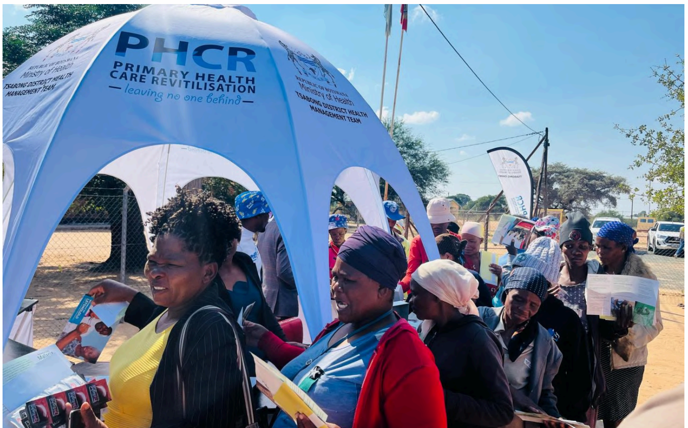
Community members queue for services during African Vaccination Week in Tsabong