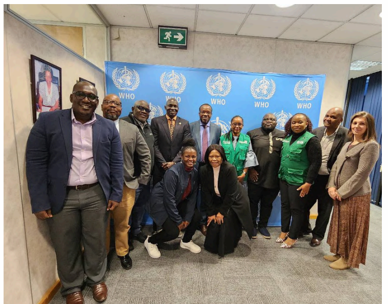
WHO Botswana and Africa CDC teams