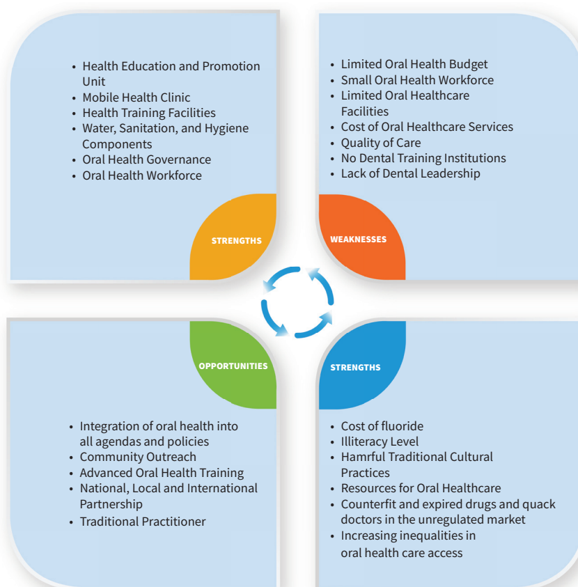
Fig. 1. Summary of the SWOT analysis for oral health in Sierra Leone

A SWOT analysis is a proven formula recognized by WHO and other health agencies that can help health systems to analyse and optimize their oral health services and dental practice. Below is a SWOT analysis of the oral health care system in Sierra Leone.