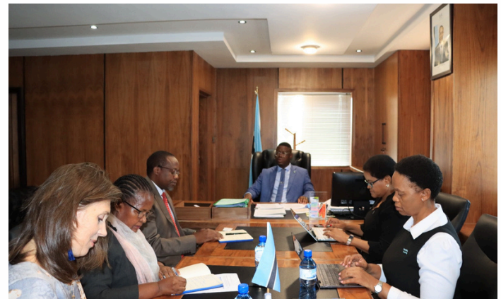
WHO Team led by Dr Fabian Ndenzako met the Hon. Kethlalefie Motshegwa, Minister of Local Government and Traditional Affairs and his team and discussed around primary health care aspects of collaboration.