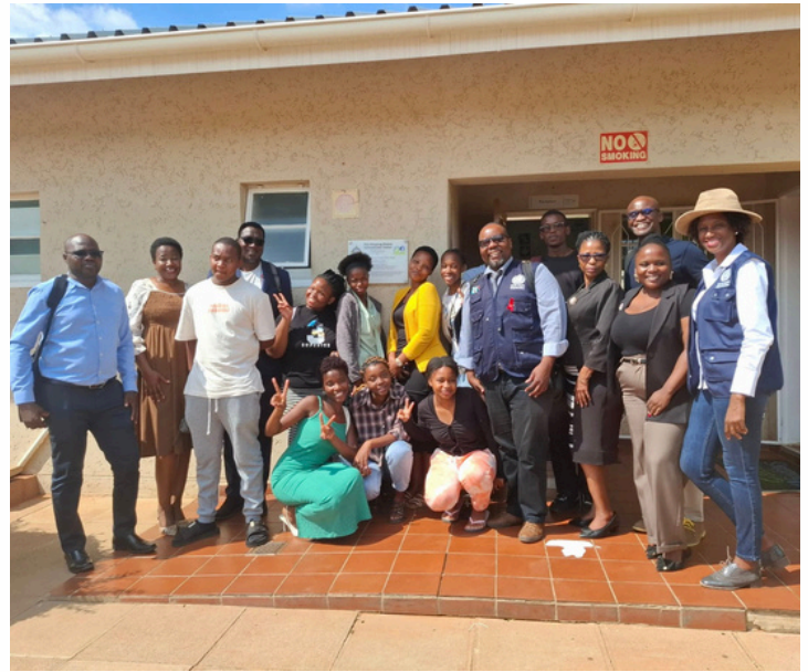
Consultative team with Stepping-Stones International students

These district-level forums were designed to ensure inclusive engagement and collect insights to guide Botswana's HIV response through 2030. Read More