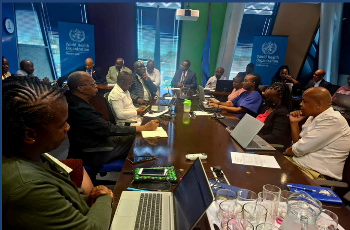
Some of the participants at the NCC meeting

Botswana has reinforced its efforts to eradicate polio as part of the global initiative outlined in the 2022-2029 Global Polio Eradication Strategy. At a recent National Certification Committee (NCC) meeting, experts reviewed Botswana’s progress in combating both wild poliovirus (WPV) and circulating vaccine-derived poliovirus type 2 (cVDPV2).