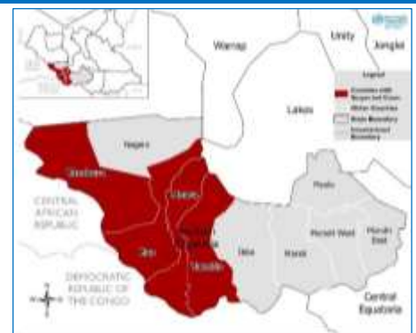
Figure 1: Location of Yellow fever outbreak in South Sudan