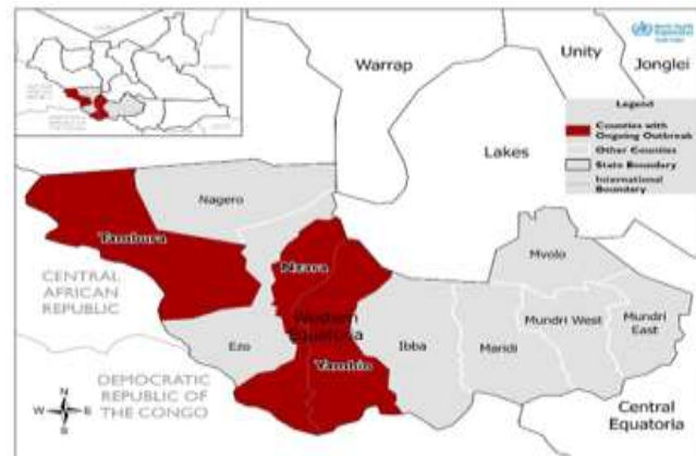
Map 1: Location of Suspected Viral Haemorrhagic Fever