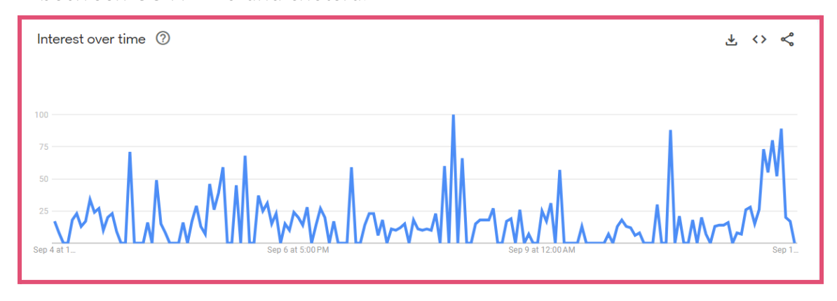
Google Trends - "cholera" in Zambia from 4 to 12 September

☐ Google Trends data shows fluctuating levels of interest in the keyword "cholera" in Zambia since September 4th, with notable peaks in regions like the Northern province where cases have emerged. Furthermore, searches for "oral rehydration therapy" and "pandemic" emerged as breakout searches, indicating a heightened interest not only in cholera treatment but also an interest in the COVID-19 pandemic. While there is no government/media focus on COVID-19 on Zambian official platforms, the search might be attributed to queries about the relation between COVID-19 and cholera.