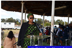
Her Majesty, Queen 'Masenate Seiso

The Minister of Education, Mrs. 'Mamookho Phiri, pledged the support of the Ministry of education to this campaign by offering that the schools can be used as vaccination points. The Minister also thanked Her Majesty for her commitment to ensuring that children in Lesotho are safe from cervical cancer.