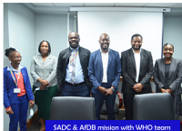
SADC & AfDB mission with WHO team

As part of effort to provide appropriate solutions to respond to COVID-19 pandemic, The African Development Bank (AfDB) and the Southern Africa Development Community (SADC) partnered with WHO Lesotho to supply biomedical equipment, diagnostics supplies and Personal Protective Equipment (PPEs) to the Lesotho Ministry of Health.