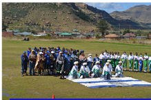
Traditional dance performance at the HPV National Launch

In 2009, Lesotho introduced the HPV Vaccine for girls aged between 9 to 14 years with the aim to combat cervical cancer in the country. However, the initiative was never sustained due to high cost of the vaccine.