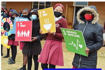
Students holding SDG cards

The project focuses on engaging the private sector and non-state actors in strengthening equitable access to relevant COVID-19 response interventions. The introduction of the COVID-19 vaccines restores hope for full-time schooling.