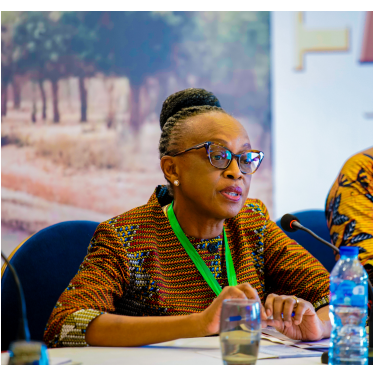
RD speaking during the Port to Arms presser