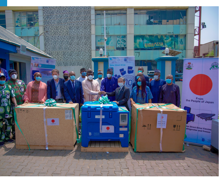
Group photograph during the handover of AstraZeneca vaccines and solar direct drive refrigerators to NPHCDA