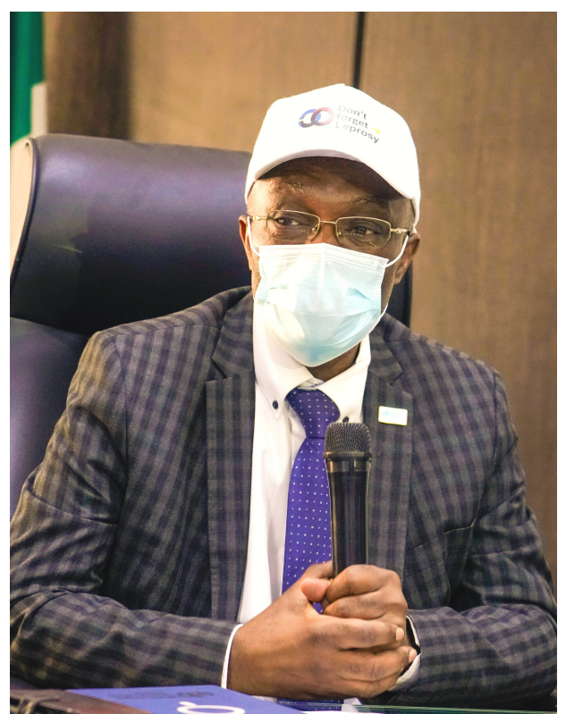
WR giving his opening remark at the Press briefing to commemorate World Leprosy Day

Government partners decry stigmatization of people living with leprosy