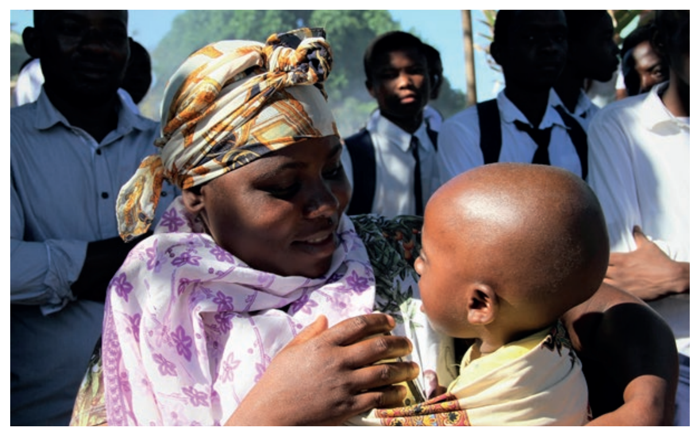
© SRHR Initiative in WHO/AFRO- Issue 2 - October 2020