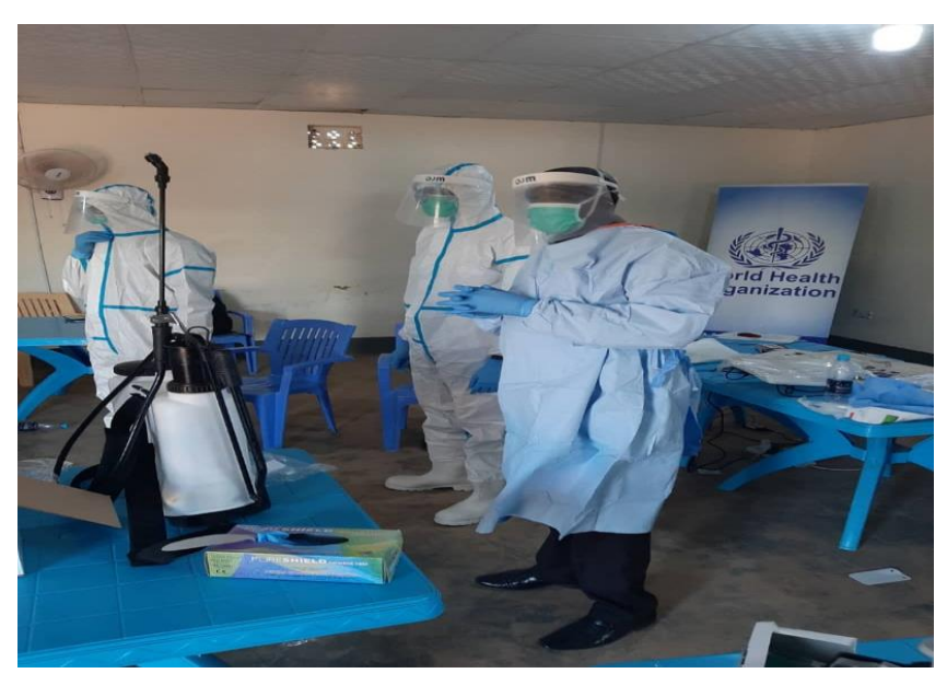
WHO and partners in Kuajok supporting the State Ministry of health to conduct a training for rapid response teams and contact tracers, 29-30 June 2020