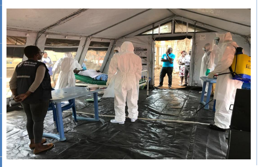
WHO technical officer conducting orientation for frontline health workers on PPE during a simulation exercise in Maridi