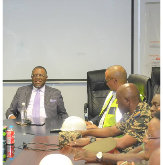
President of the Republic of Namibia, H.E. Dr Hage Geingob addressing officials at the Hosea Kutako International Airport (HKIA) after inspecting the 20 bed military mobile isolation hospital and 4 bed isolation facility of MoHSS.