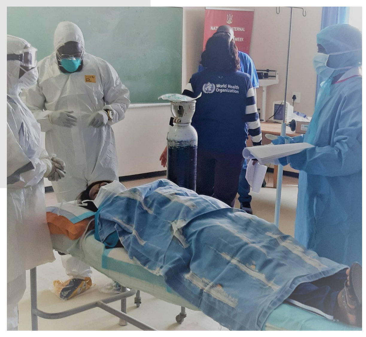
Simulation for Regional Response Teams in Swakopmund.

• SOPs for management of COVID patients have been developed.