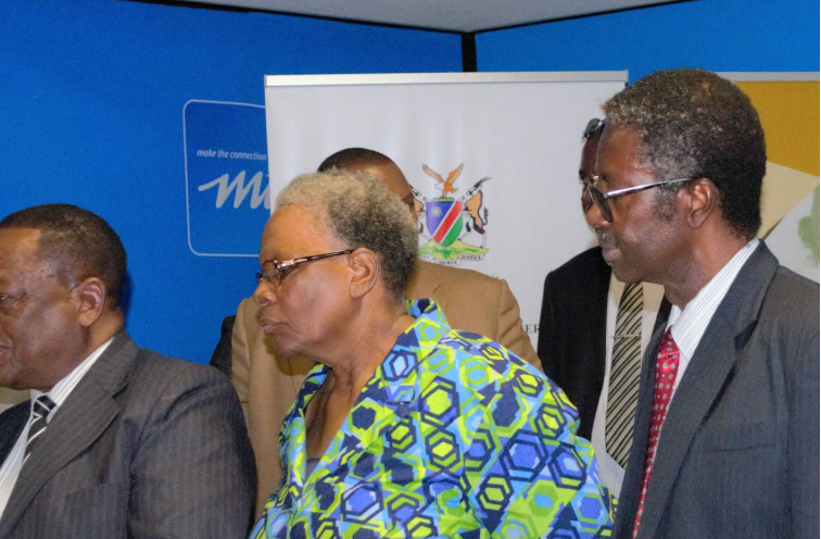
Minister of Health and Social Services, Hon. Dr. Kalumbi Shangula, Deputy Prime Minister and Minister of International Relations, Right Honorable Netumbo Ndaitua and WHO Representative, Dr Charles Sagoe-Moses at the HKIA point of entry inspecting the readiness of the airport for screening and isolation of probable COVID-19 cases.