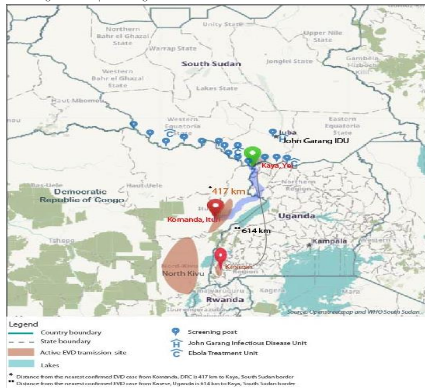
Figure 2: map showing Ebola virus disease associated risks to South Sudan