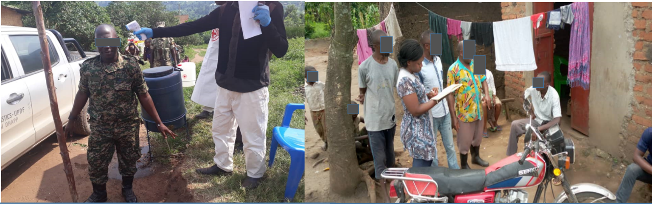
Screening at PoE