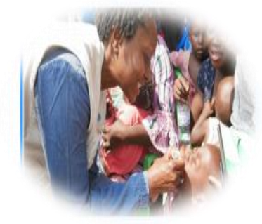
Unicef Representative administeringmOPV2 at lauching ceremony, Round 0 in Bimbo