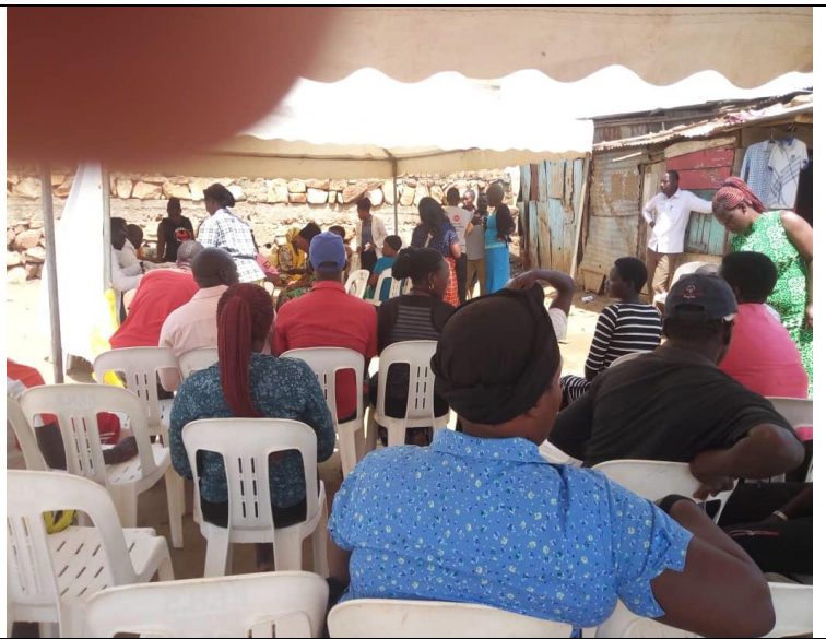
Integrated family planning camp together with community dialogue at Nsiike Ndebba, Lubaga