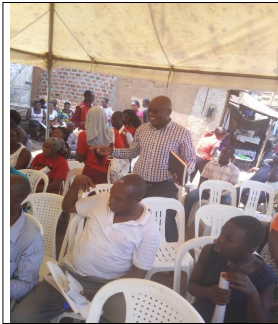
Community Baraza in Katanga Kawempe Division