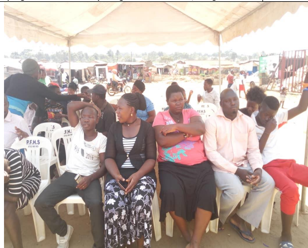
Community dialogue meeting during family planning outreach at Nsiike, Ndebba Lubaga