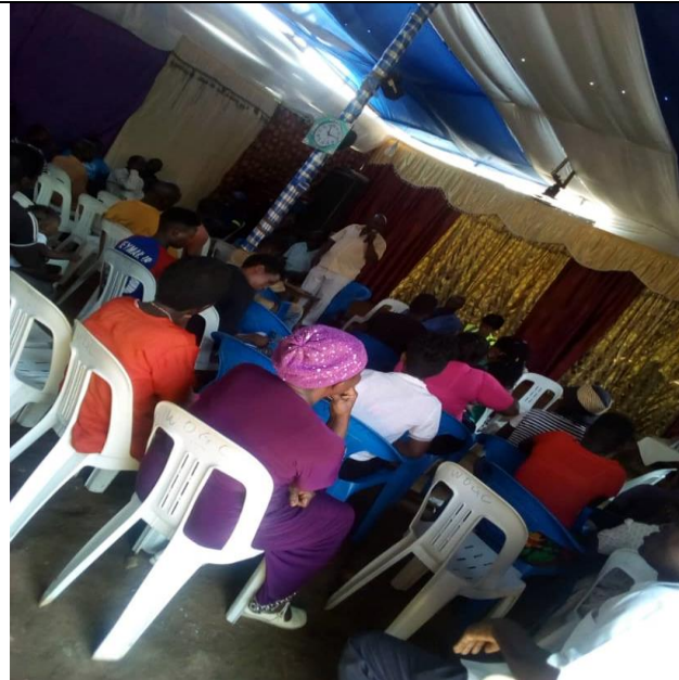
Bazara held at Katogo Zone, Makindye Division.