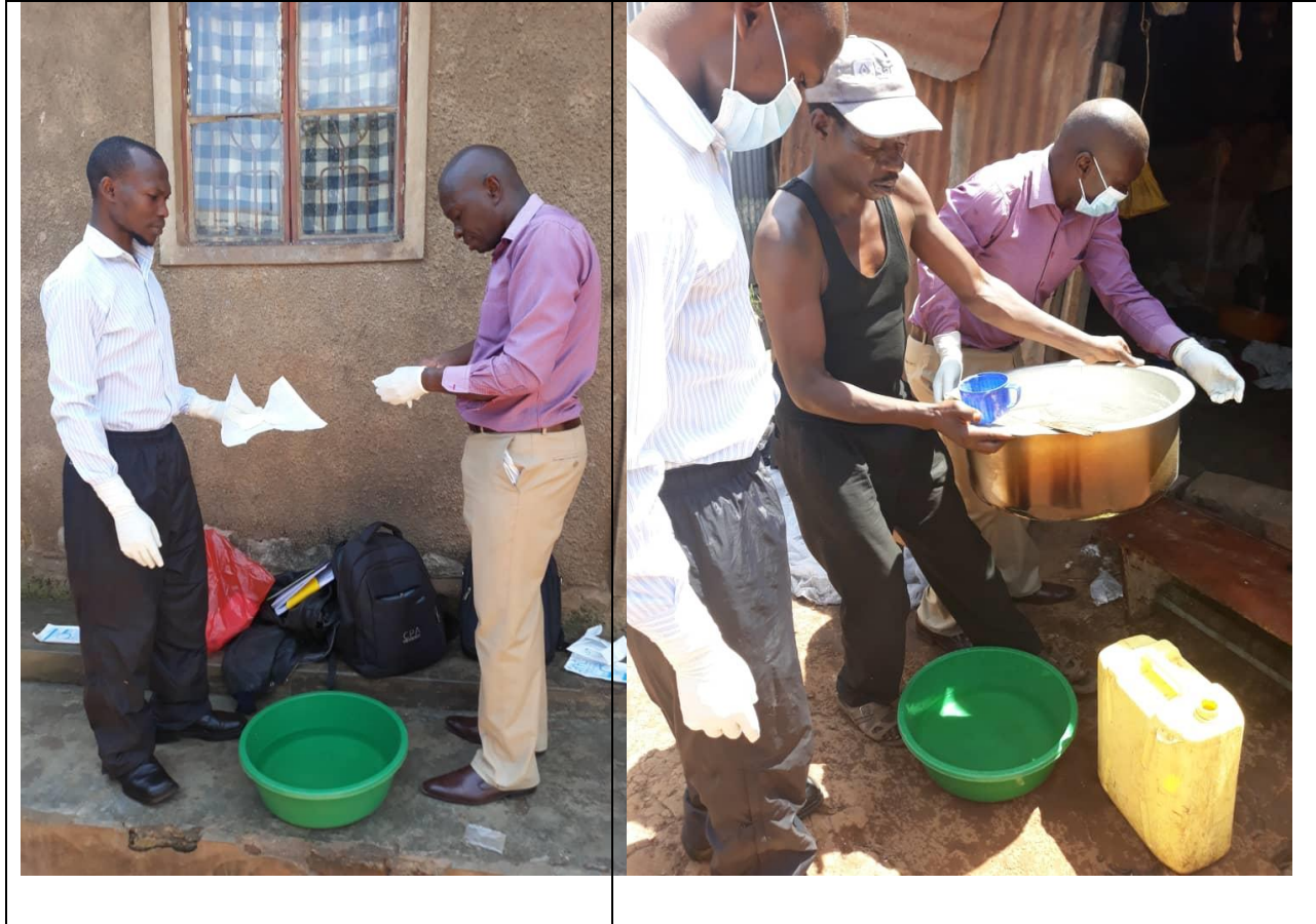
Makindye Division Team at the scene of the community death at Katwe II Musoke Zone