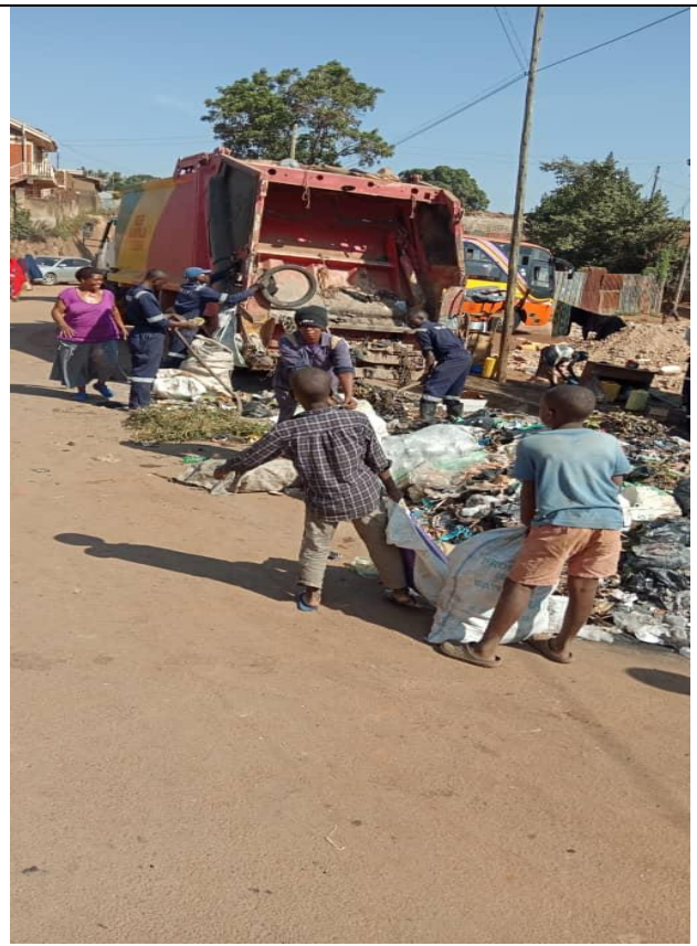
Central Division Team joined by the UPDF for a cleanup in Mengo Parish