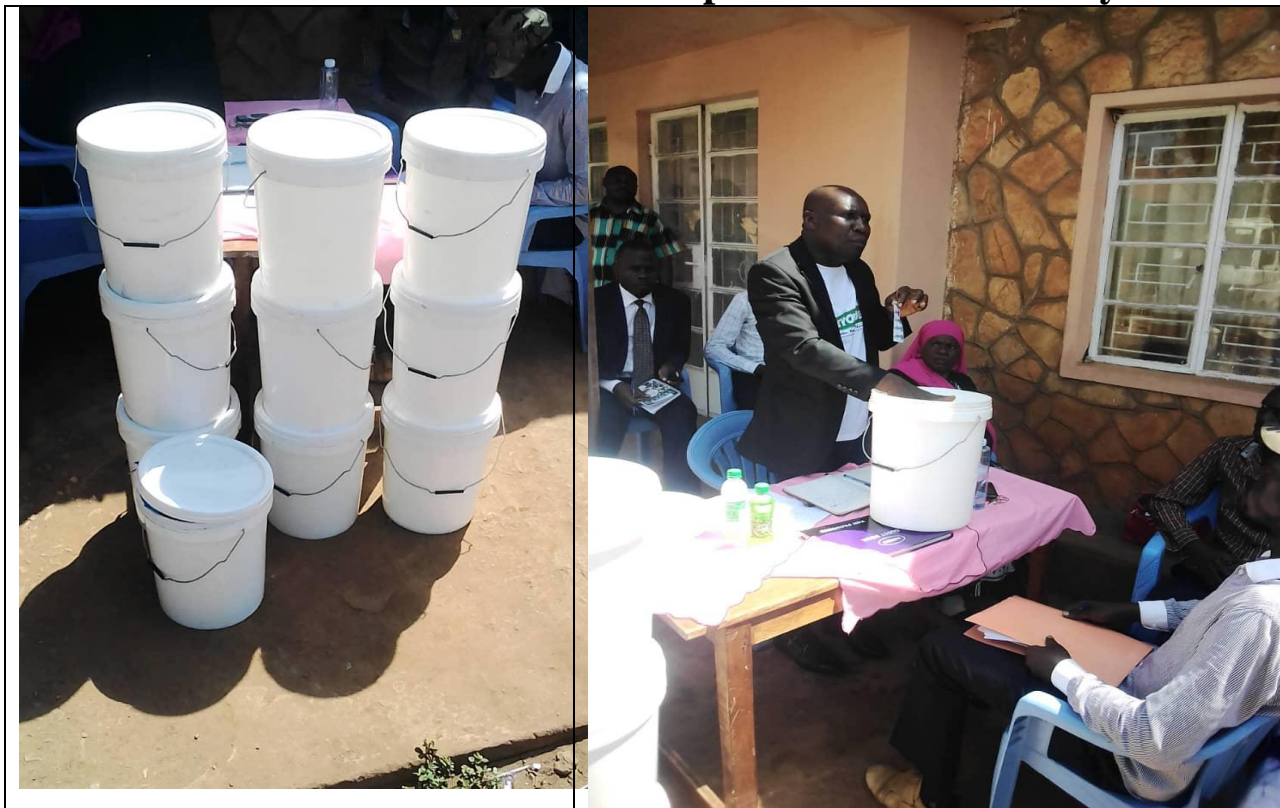
Sensitization and distribution of the cholera discharge kits in Central Division led by the Mayor