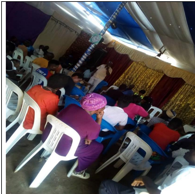
Bazara held at Katogo Zone, Makindye Division.