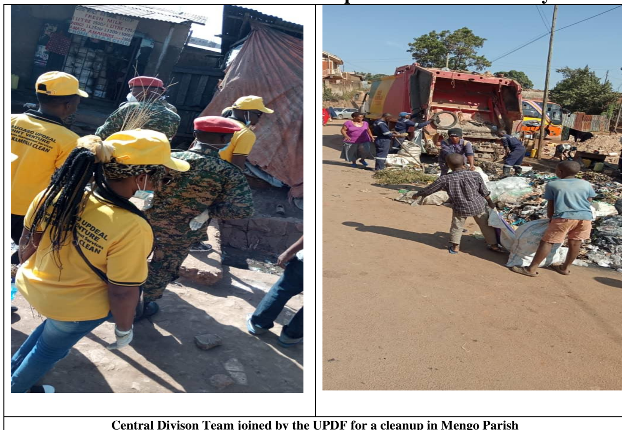
Central Divison Team joined by the UPDF for a cleanup in Mengo Parish