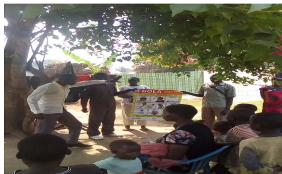
Community sensitization on EVD