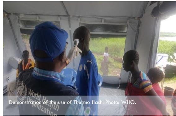
Demonstration of the use of Thermo flash.