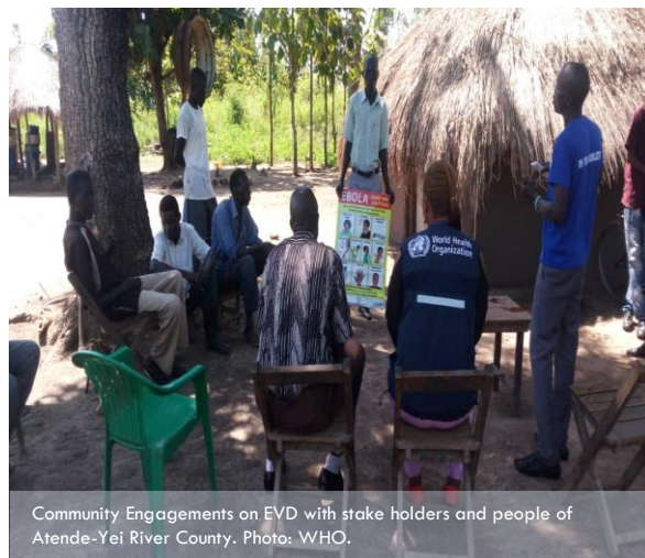
Community Engagements on EVD with stake holders and people of Atende-Yei River County.