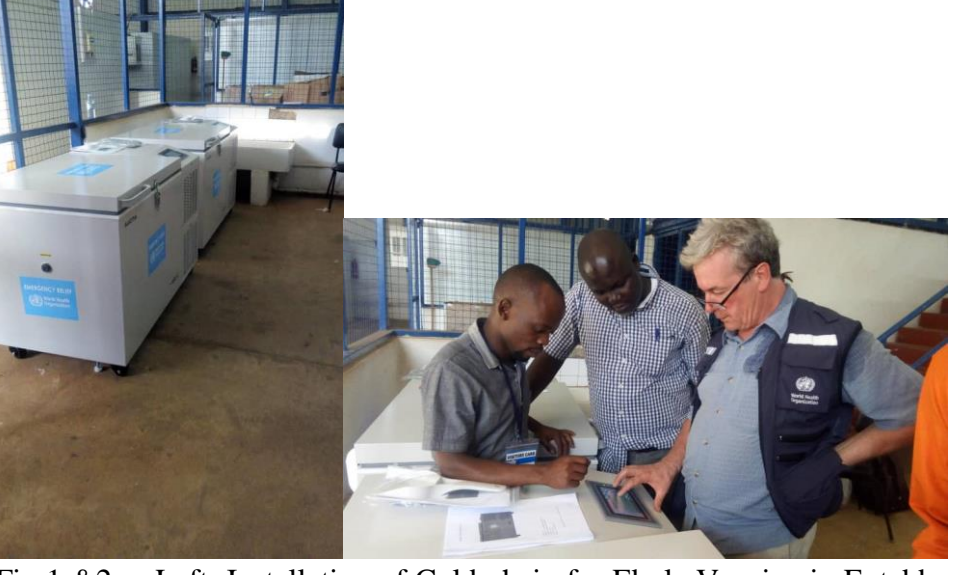
Fig 1 &2 – Left; Installation of Cold-chain for Ebola Vaccine in Entebbe at NMS. Right – WHO and MOH staff configuring the temperature reading on the cold chain freezers

Cold chain equipment installed at NMS in Entebbe on the 18<sup>th</sup> Sept 18