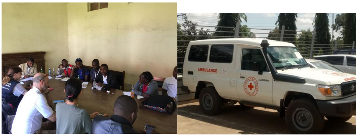
Fig 3 – Kabarole DTF 19<sup>th</sup> September 2018 (Left)