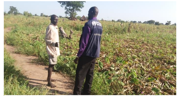
WHO field staff on a follow up visit in Wun-acier village.