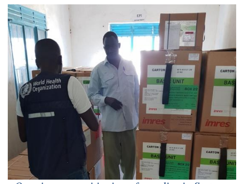
Ongoing prepositioning of supplies in States

Following the elevation of the WHO risk assessment of the DRC EVD outbreak from High to very high, the national EVD taskforce is working with partners to enhance surveillance and risk communication in Juba and the high-risk states. The focus now is to attain operational readiness necessary for responding to any suspect EVD case.