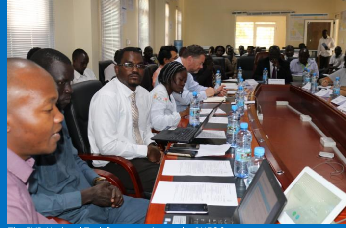
The EVD National Task force meeting at the PHEOC

Humanitarian Situation Report Issue # 36 24 - 30 SEPTEMBER, 2018