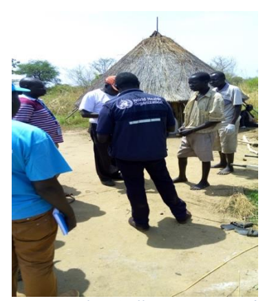
Training of CBS officers in Iyire and Imoruk payam, Torit