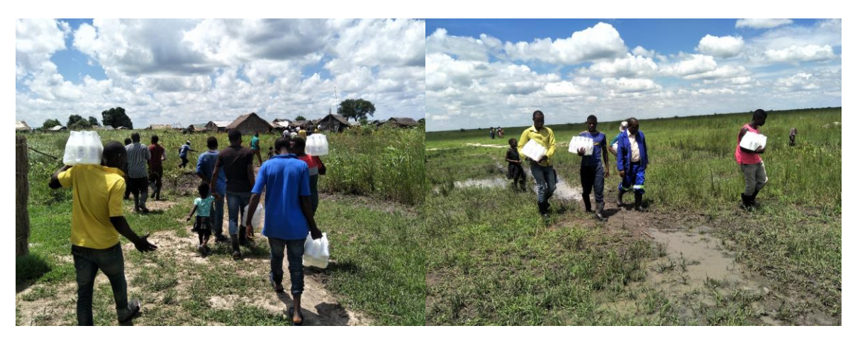
Figure2:Chlorine distribution in Shibuyunji