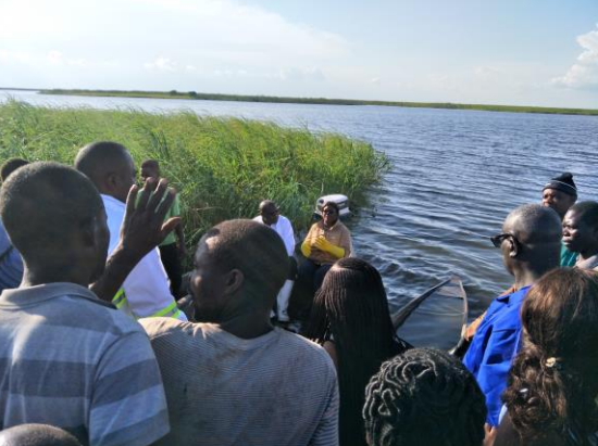
Figure 2 &3: Honourable Minister of Health Dr Chitalu Chilufya, Honourable Minister in the Vice Presiden't office Ms Chalikosa, Honourabe Minister Lusaka Provinde Mr. Japhen Mwakalombe and other high level delegates visit fishing camps and nearby villages Shibuyunji Distrct