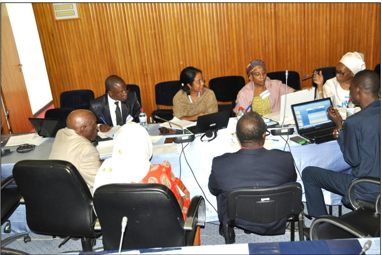
Group work photo

Three group work sessions were organized to outline joint actions for implementation in 2017