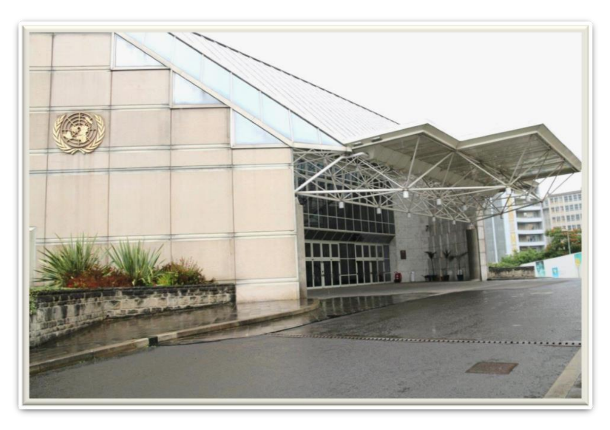
Front view of the United Nations Conference Centre