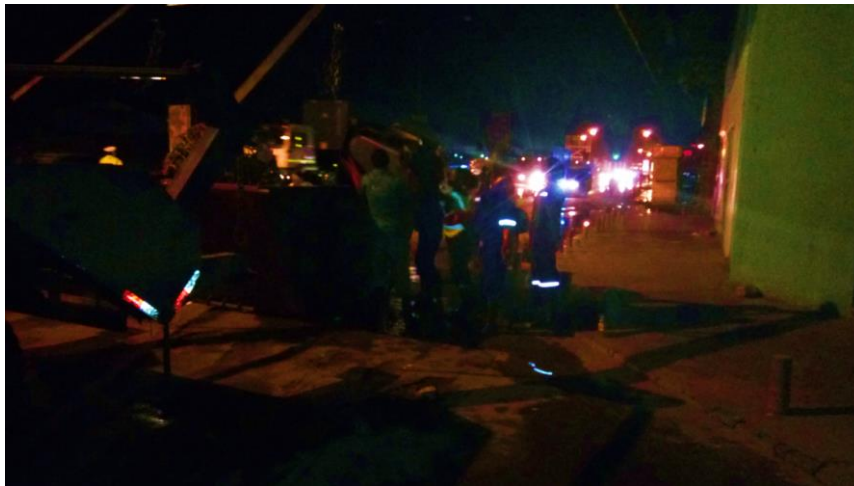
Figure 2: Night time solid waste collection by LCC