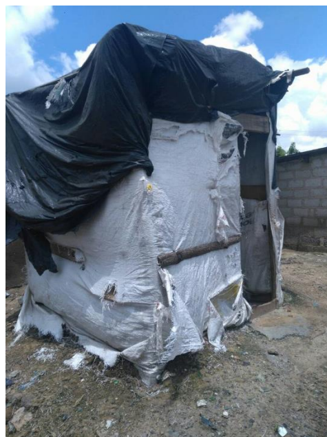
Figure 3: One of the pit latrines in George compound discovered during the sanitation enforcement exercise