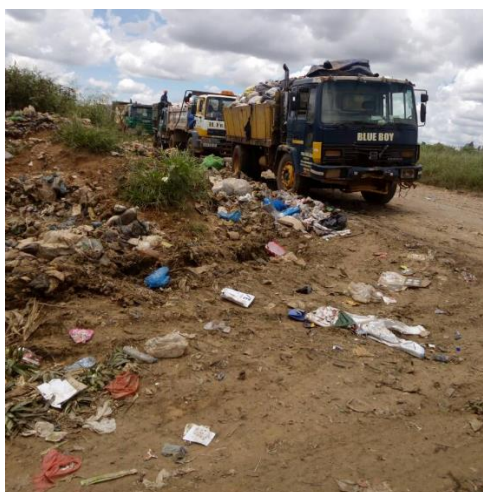
Figure 4: Vehicles line up to dump waste