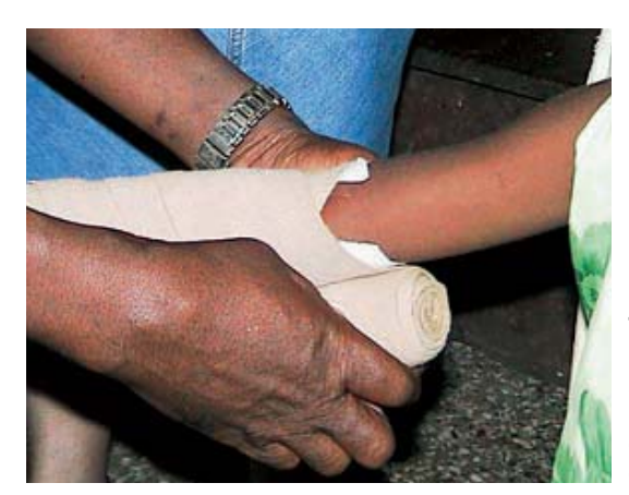
Apply moderate pressure and avoid tight restrictive bandages which increase oedema.

The rolled elastic bandage is slowly stretched and unrolled at an angle covering two thirds of the previous wrap.