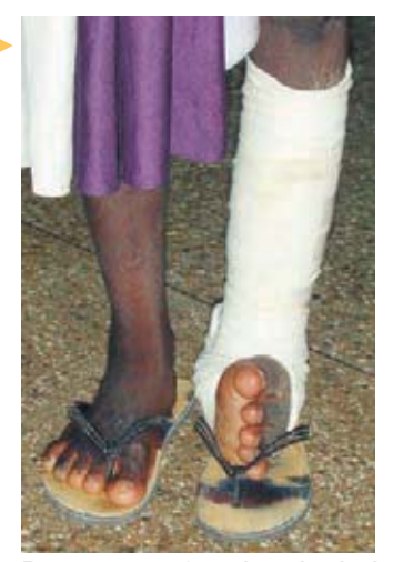
Person was referred to physical therapist for crutches and prosthetic training to correct foot deformity.