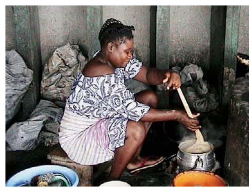
■ Use care during activities involving fire or heat and with clothing that may rub over newly-healed skin.