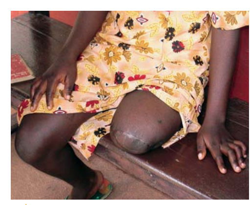
These people were referred for prosthesis and prosthetic training (arm, eye and leg)