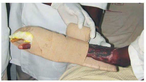
Wrist supported in extension, and thumb abducted down with gentle pressure with the bandage on the fingers, improves the patient's ability to flex the fingers and regain a grasp.