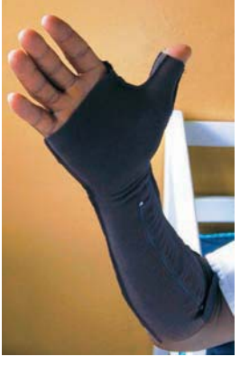
Actively contract muscles with frequent hand opening/closure and foot plantar/dorsiflexion movement.