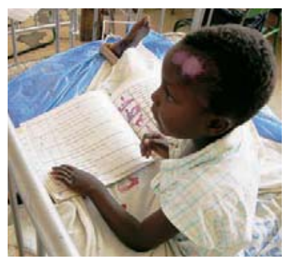
Children are referred to teachers for assistance in continuing their education during and following hospitalization.