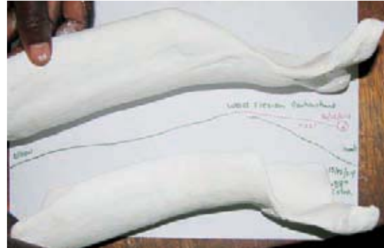
Wrist flexion contracture is lessened with a plaster splint worn 24 hours. Wrist extension improves within 24 hours, and change is noted in the better wrist extension position of the new splint.