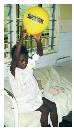
■ Carry out ADL and exercises as independently as possible, avoiding long periods with the limbs down. Try to adapt exercises using activities which permit the limb to be used in an elevated position.