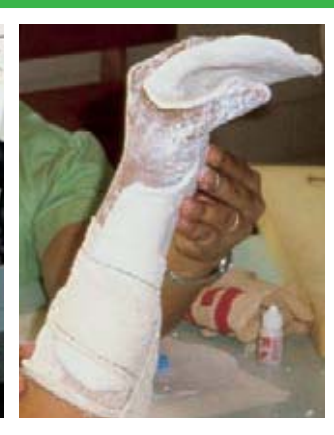
Place in an antideformity position.