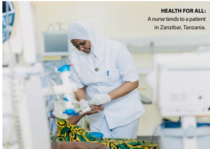
HEALTH FOR ALL: A nurse tends to a patient in Zanzibar, Tanzania.

An inaugural conference offers an unprecedented opportunity.